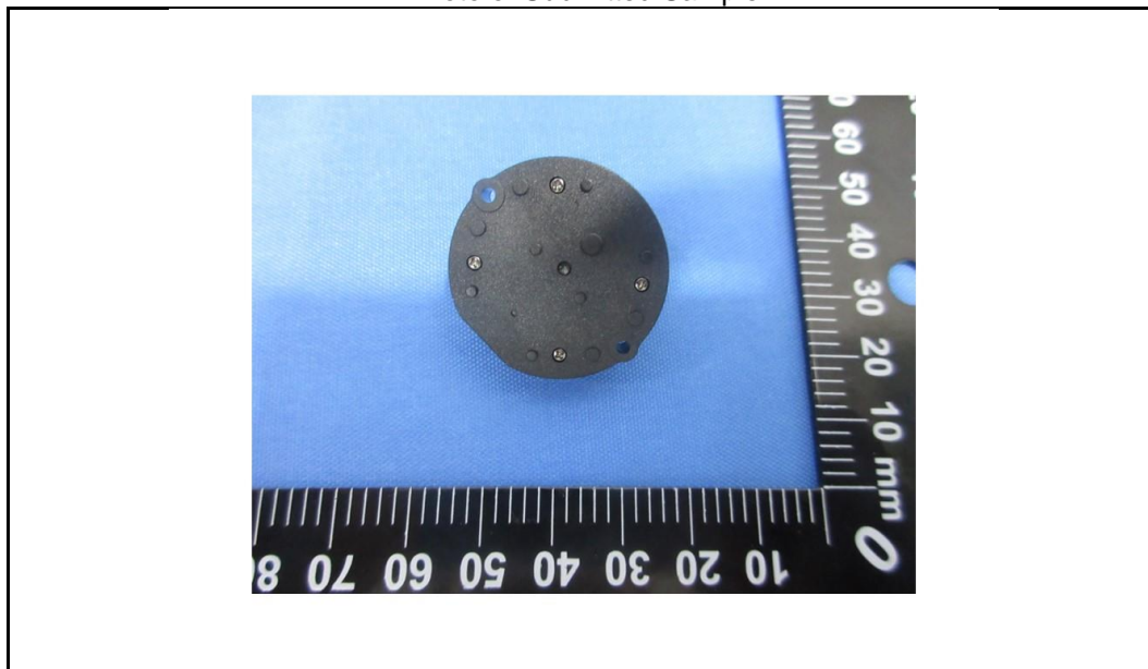
Photo of Submitted Sample